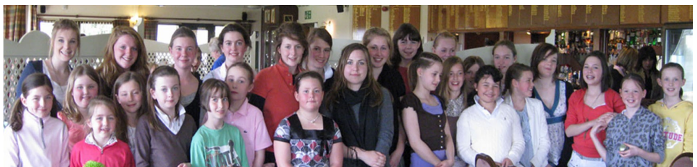
All the girls who played in the Spring Meeting—looking very happy after receiving their easter eggs!