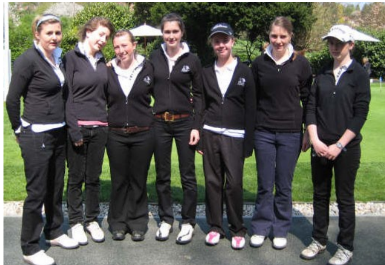
The team who played against Berkshire from left to right:

Congratulations to the girls for a fantastic start to the season!